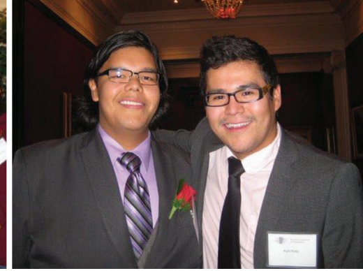
Photos from Award Events in Winnipeg